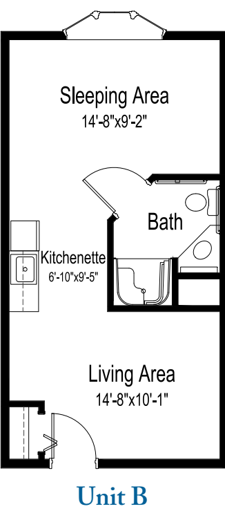
402 square feet