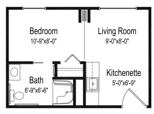
Suite D One bedroom, one bathroom