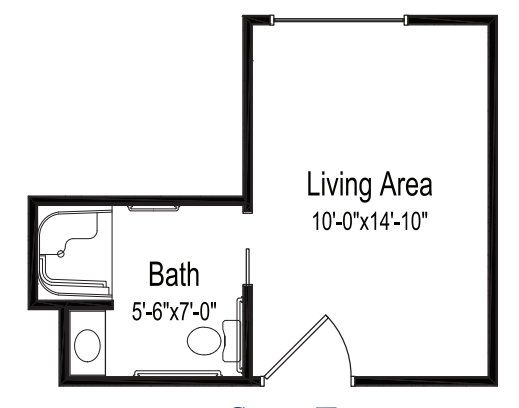
Suite E One bedroom, one bathroom