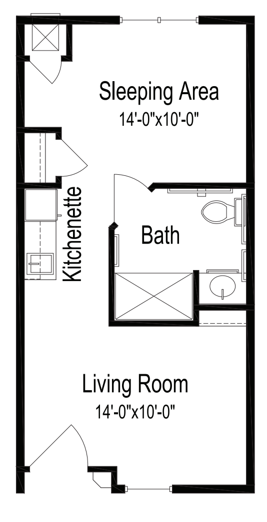
Studio 399 square feet (Dimensions and square footage may vary)